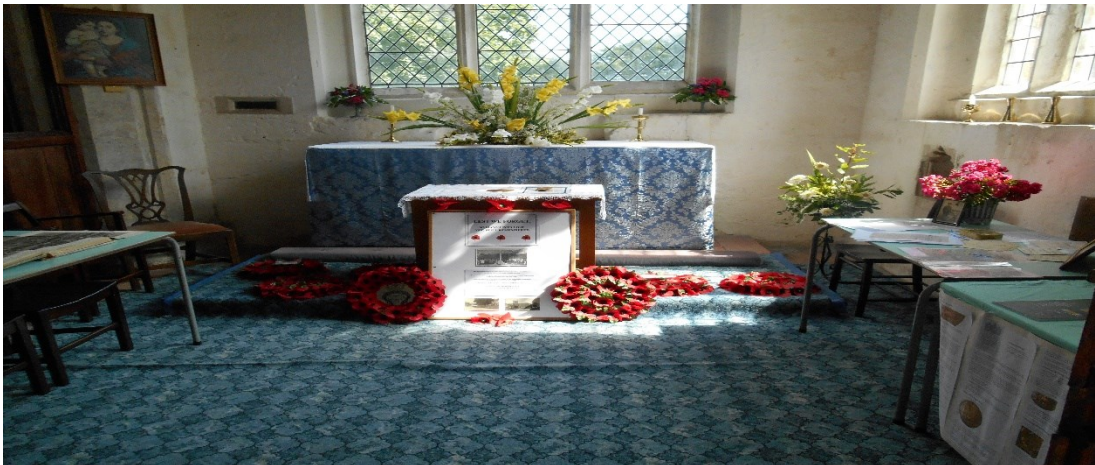
The Lady Chapel, St Nicholas Church – 3 rd August 2014

It is hoped to hold more events in the future with the aim of raising funds to provide a small kitchen and toilet facility at the Church.