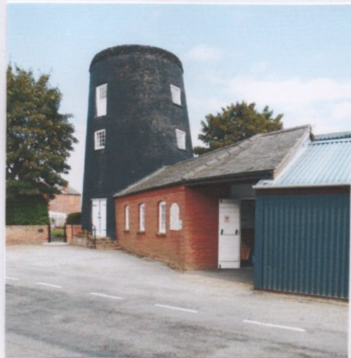
Addlethorpe Village Fete Circa pre World War 1