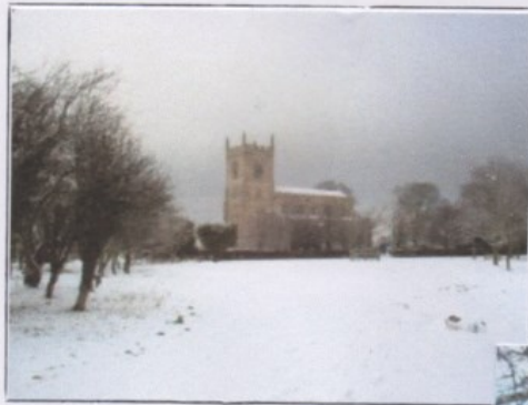
The Church in Winter